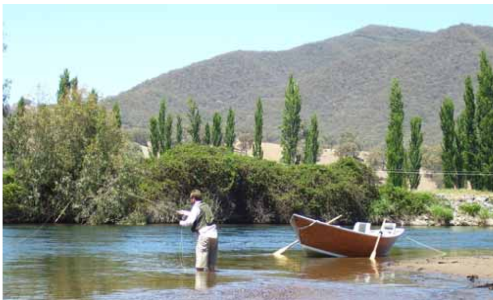
Fishing using the McKenzie style drift boats on the Tumut River from the Nimbo Fork Lodge.